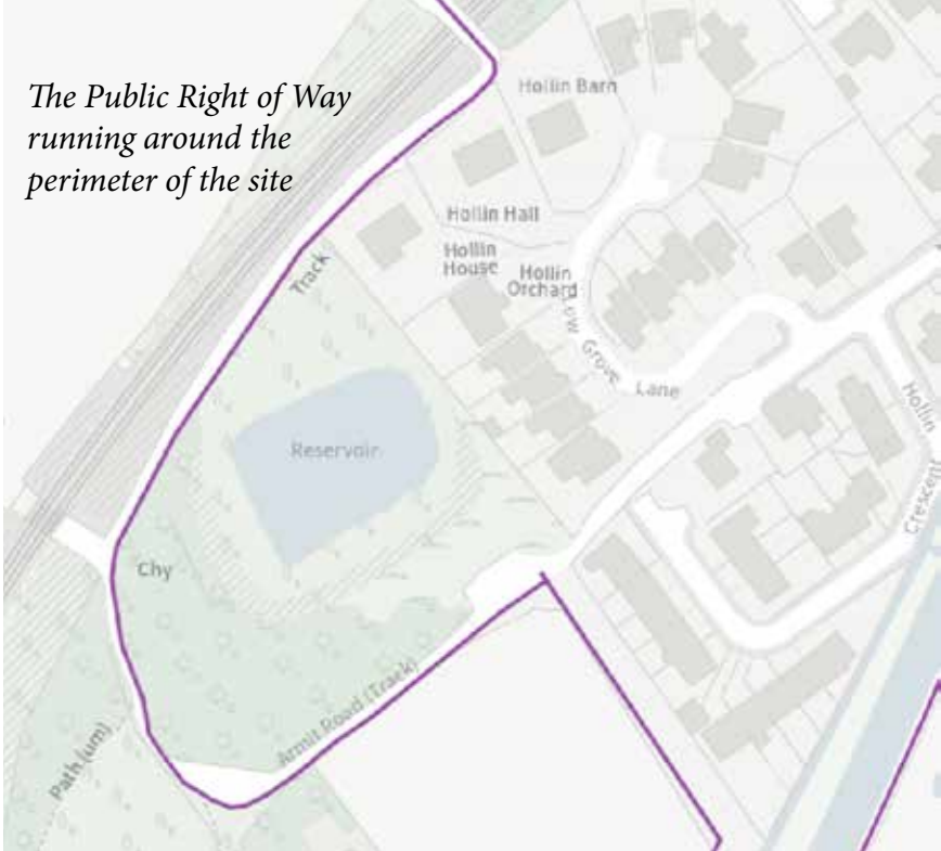
The Public Right of Way running around the perimeter of the site

Should there be any future development in the vicinity of the site or change in the use of the location, the Parish Council would recommend reviewing whether the Local Green Space classification should be introduced.