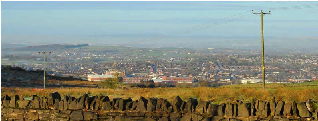
View Across Oldham