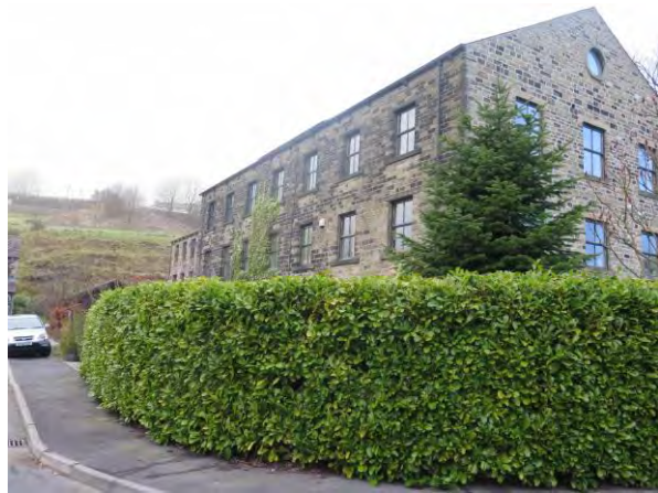
Denshaw Vale Works

the Borough. The scope of the assessment does not include detailed viability assessments of each individual mill and merely seeks to provide an overview based upon a series of assumptions to identify common themes and potential barriers to redevelopment.