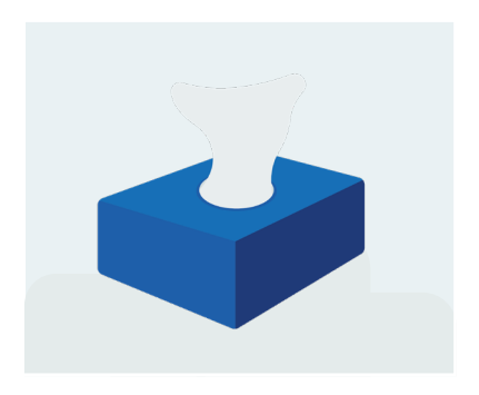
You'll be shown to a space where you can do your test and be asked to blow your nose, so your airways are clear.