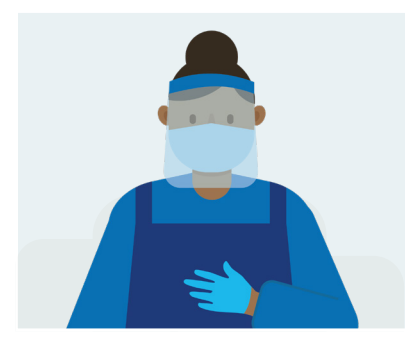
You will do your test yourself with support from a testing helper.