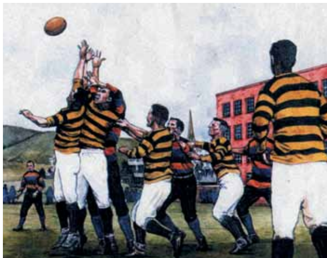
Oldham FC (Red and amber strip)