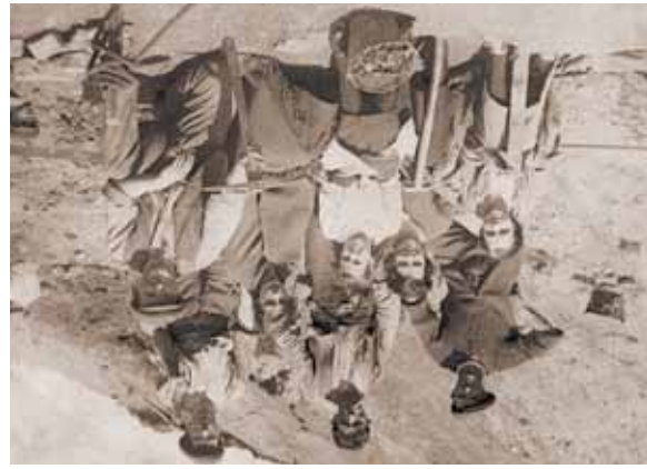
Families digging for coal during the Miners Strike, 1926