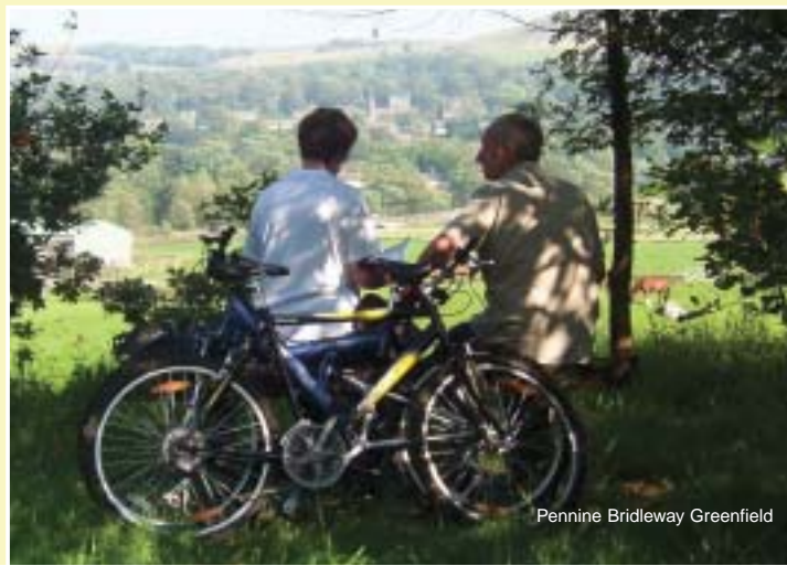
Pennine Bridleway Greenfield