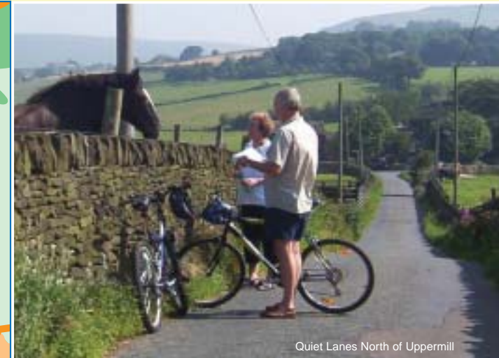
Quiet Lanes North of Uppermill