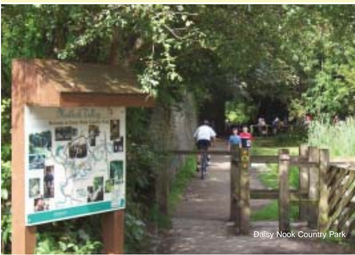
Daisy Nook Country Park