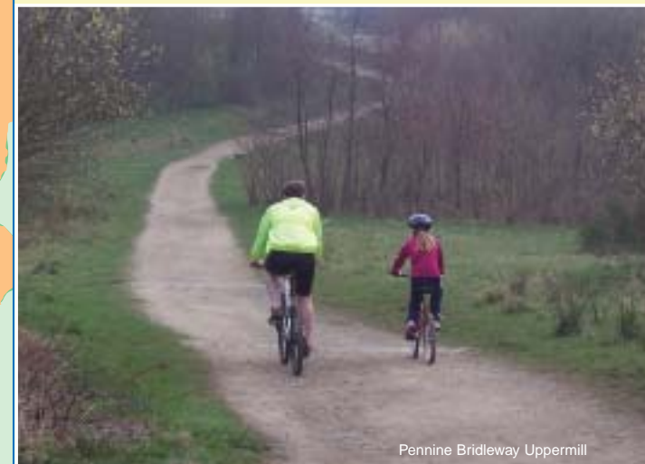
Pennine Bridleway Uppermill