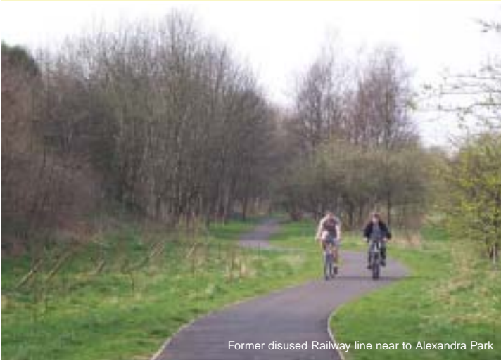
Former disused Railway line near to Alexandra Park