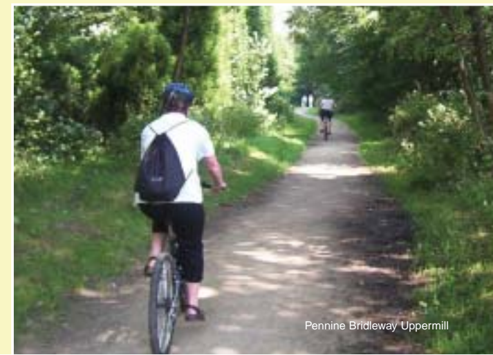
Pennine Bridleway Uppermill