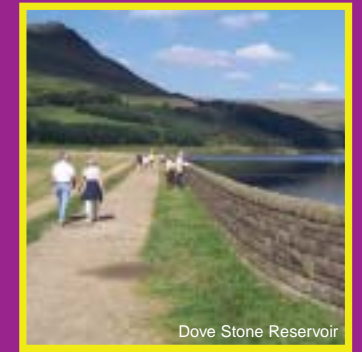
Dove Stone Reservoir

Nestled between the Saddleworth villages of Uppermill and Dobcross, Brownhill Countryside Centre is the base for Oldham Countryside Service's Rangers who manage the council owned land across Saddleworth. The Centre hosts a range of exhibitions connected with the local area and countryside themes.