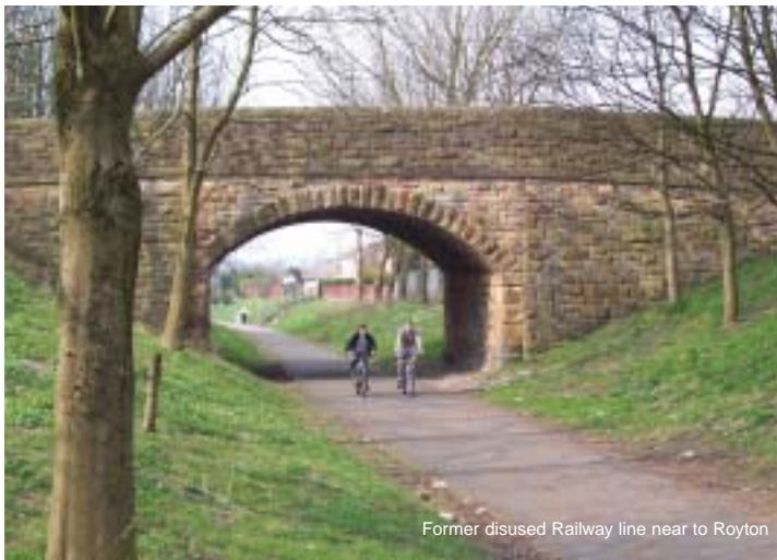
Former disused Railway line near to Royton