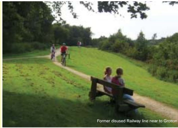
Former disused Railway line near to Grotton