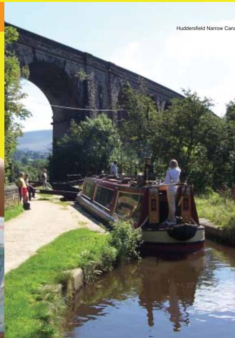
Huddersfield Narrow Canal