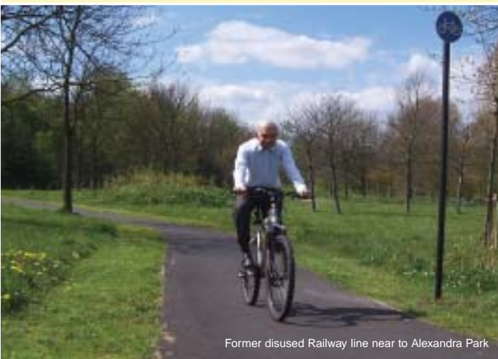
Former disused Railway line near to Alexandra Park