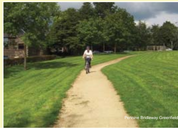
Pennine Bridleway Greenfield