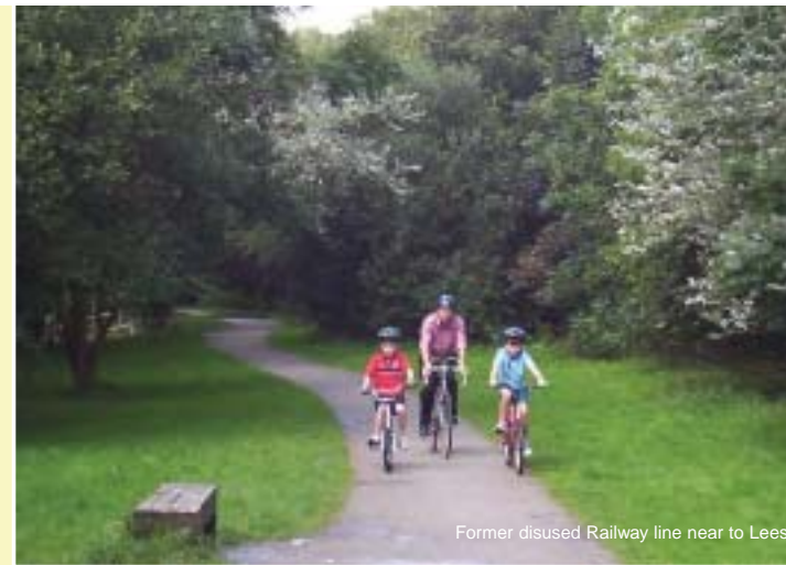
Former disused Railway line near to Lees